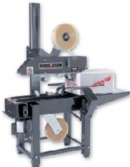
(Shown with optional pack table.)