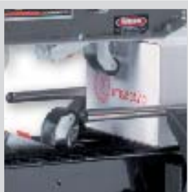
Self-centering side rails

Little David delivers packaging equipment that works for you